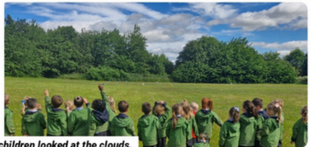
The nursery children looked at the clouds.