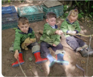
Some children went fishing.