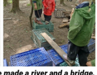
We made a river and a bridge.